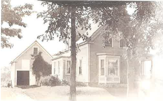
Above, as the house appeared in early 1900s. To the right, as it appears today.