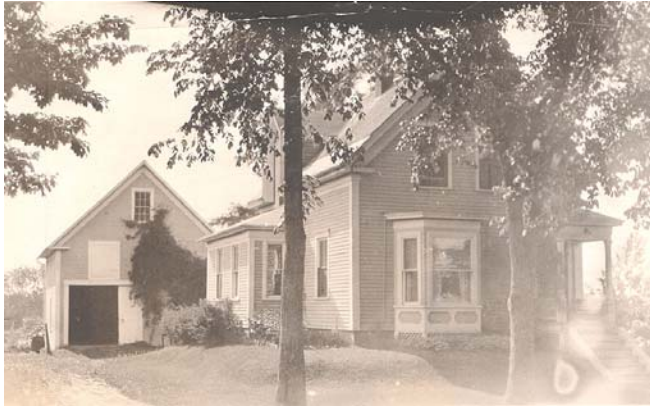
Above, as the house appeared in early 1900s. To the right, as it appears today.